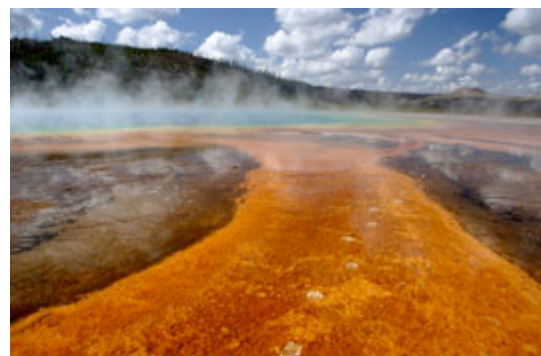
Grand Prismatic Spring, Yellowstone National Park, Wyoming

Geothermal plants emit 97% less acid rain-causing sulfur compounds than are emitted by fossil fuel plants. After the steam and water from a geothermal reservoir have been used, they are injected back into the Earth.