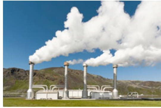
A Geothermic Power Station

Geothermal power plants use hydrothermal resources that have two common ingredients: water (hydro) and heat (thermal). Geothermal plants require high temperature (300°F to 700°F) hydrothermal resources that may come from either dry steam wells or hot water wells. We can use these resources by drilling wells into the Earth and piping the steam or hot water to the surface. Geothermal wells are one to two miles deep.