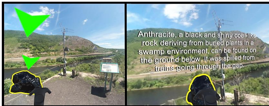
Fig. 1. Using the controller 'Grip', it is possible to freely manipulate 3D objects. Once grabbed, its description appears.