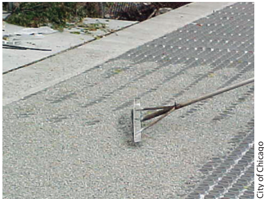
Raking gravel into a Gravelpave2 system.