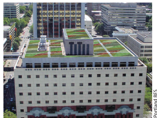
Figure 6: Portland Eco-Roof

The Portland Bureau of Environmental Services (BES) has a green roof on its headquarters. The city allows denser development for projects that use green roofs, or eco-roofs as the city calls them.