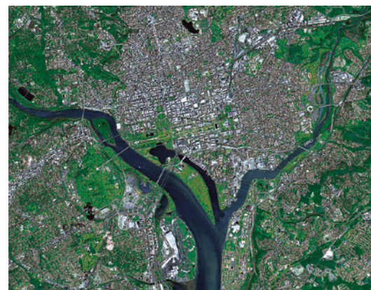
Figure 8: Tree Canopy in Washington D.C.

Construction in and around Washington, D.C., has reduced tree cover (green in this image), but many efforts have formed to slow or reverse this trend.