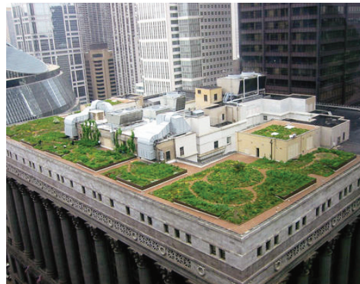
Figure 1: Chicago City Hall Green Roof

Katrin Barth-Scholz/Department of Energy