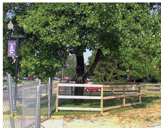
Figure 4: Fences Protect a Tree During Construction

Annapolis, Maryland, explicitly recognized the environmental value of trees and acted to protect them during construction. The "Tree Protection Ordinance" requires a survey of trees on a proposed development site and fences or other means to mark and protect designated trees during construction. The ordinance also prohibits certain activities, such as trenching or grading, within the dripline of trees, unless specific precautions are followed. More information on this ordinance is available under §17.09 City Code at http://bpc.iserver.net/codes/annapolis/ .