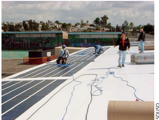
Figure 2: Cool Roofs with Solar Panels in San Diego

The San Diego Unified School District won an ENERGY STAR award in 2007 because almost 70 percent of its buildings, including this elementary school with a cool roof and solar panels, met ENERGY STAR specifications.