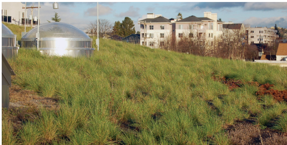
Figure 7: Seattle Public Library

Seattle promotes green roofs, such as this one on a city library, through its Green Factor program.